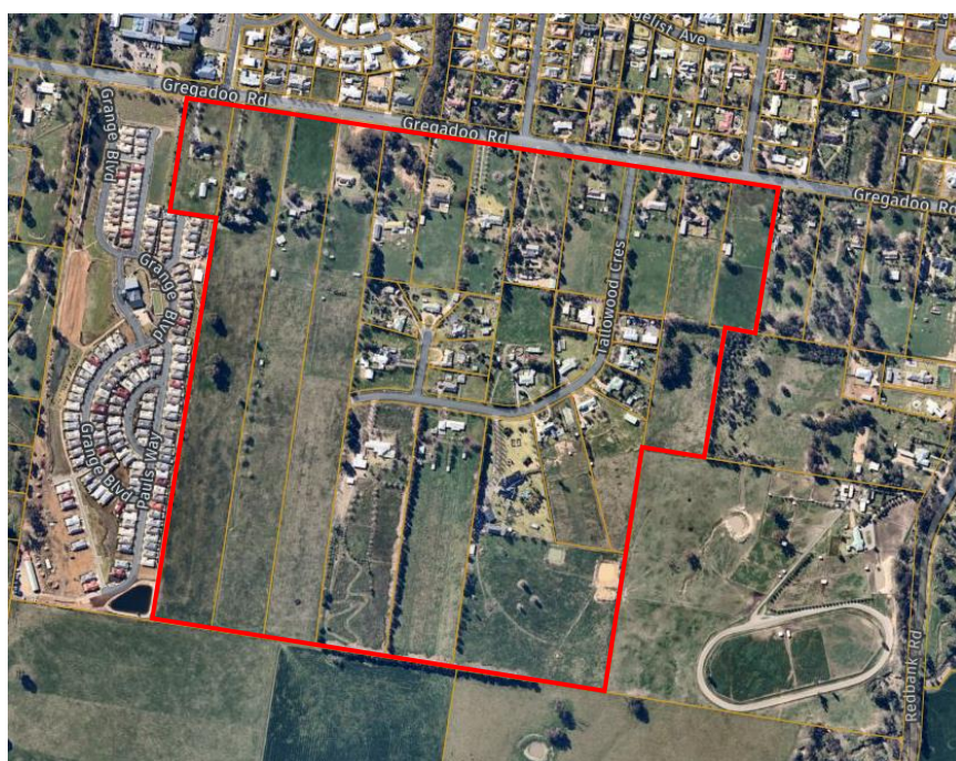
Figure 9.5.2a – Gregadoo and Tallowood Precinct

This section provides site-specific provisions for land located on the southern side of Gregadoo Road as identified in figure 9.5.2a below: